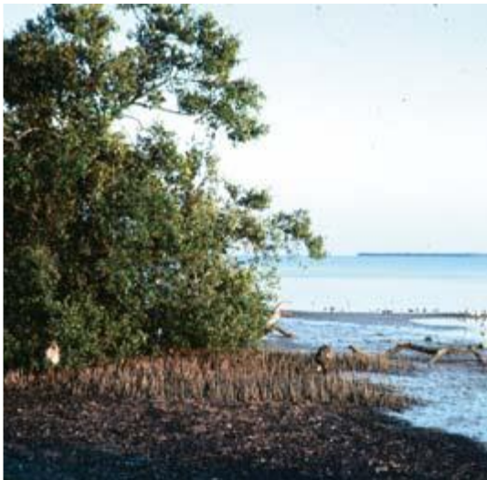
Pneumatophores; Avicennia germinans , black mangrove.