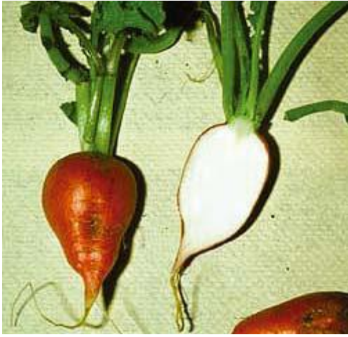
Storage roots; Raphanus sativus , radish