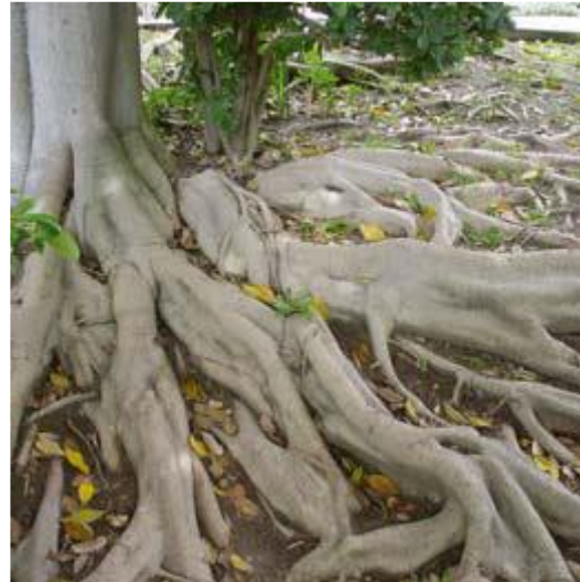
Buttress roots; Ficus rubiginosa