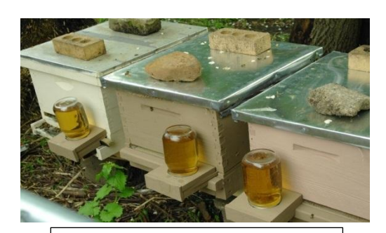
Boardman (entrance) feeder