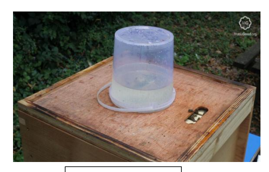
Slow jar feeder