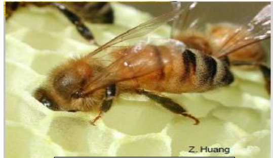
Worker clean the cell