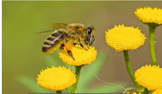
Worker collect pollen