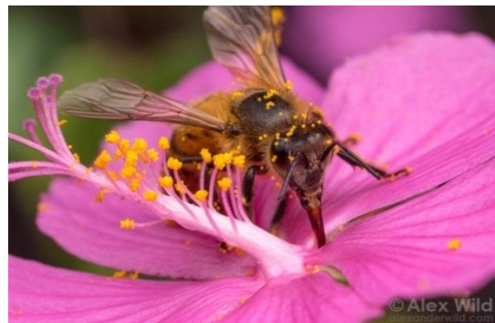
Worker collect nectar