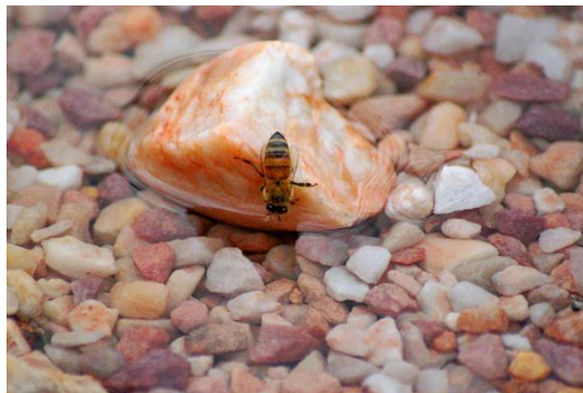
Worker collect water