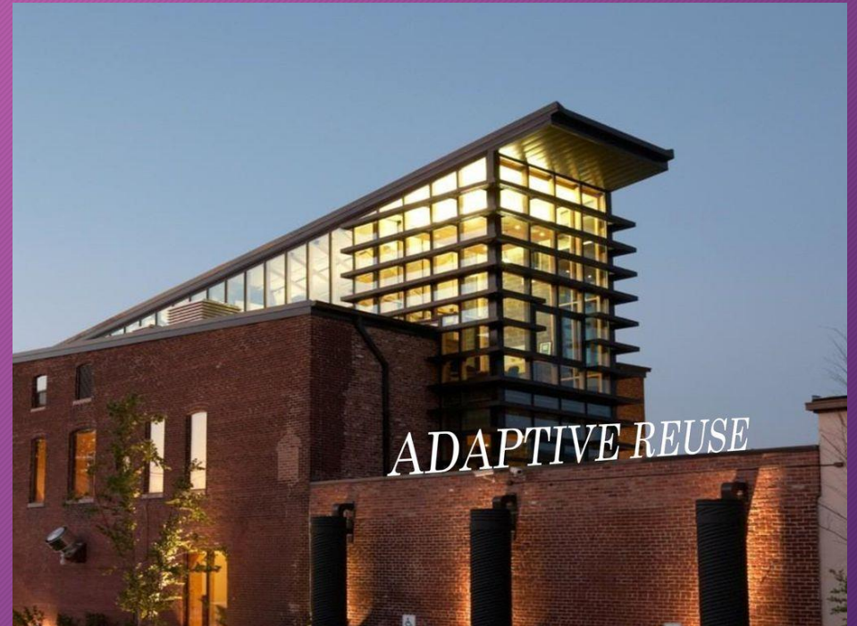
REPURPOSING OLD BUILDINGS