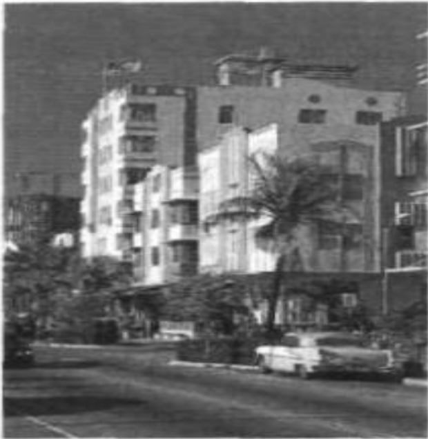
▲ Ocean Drive Miami Beach