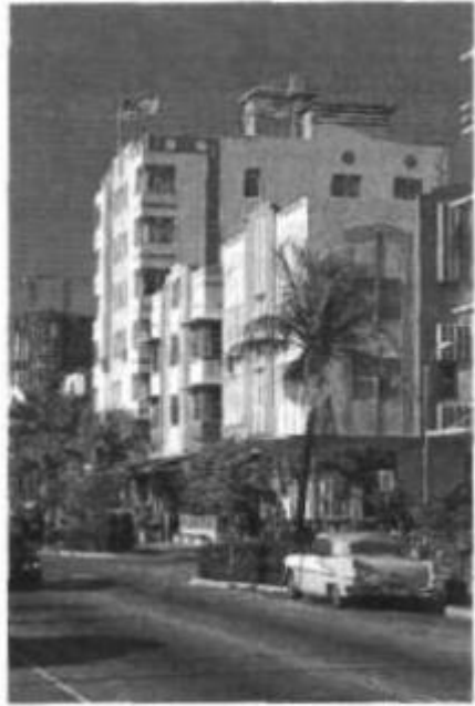
▲ Ocean Drive Miami Beach