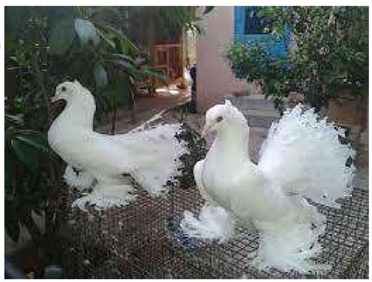
Fantail Indian pigeon