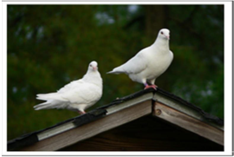
Homing pigeon 2 White pigeon