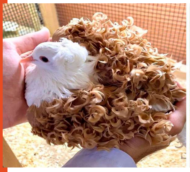
Brown Frill back Pigeon