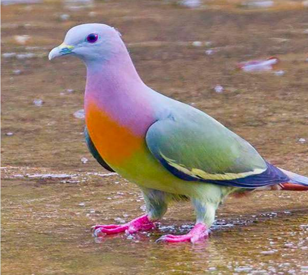
Pink-Necked Green Pigeon Fancy pigeon