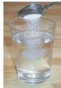
Salt Dissolved in Water Crystalloid