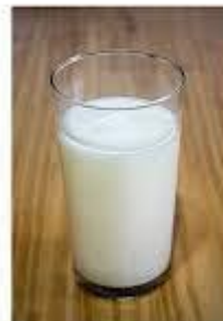
Milk Mixed with Water Colloid