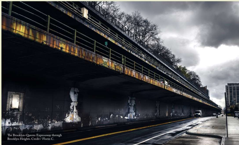
The Brooklyn-Queens Expressway through Brooklyn Heights.