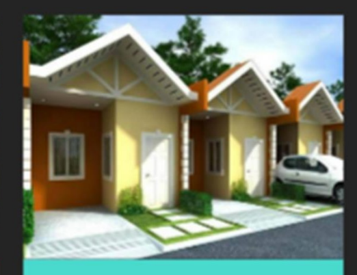
Provide housing at lower cost