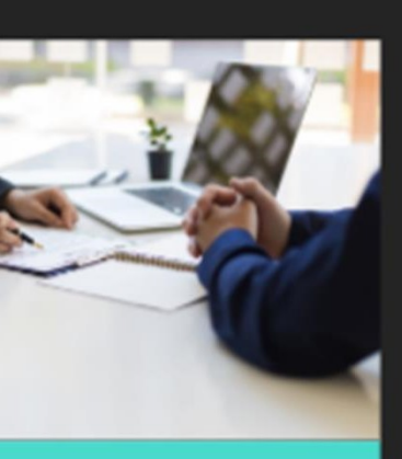
Provides local Jobs